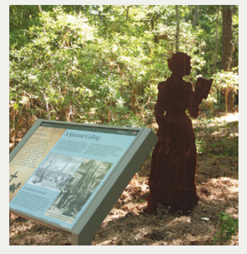
New Freedom Trail exhibits

Over the past few years, some of the projects you've made possible include: