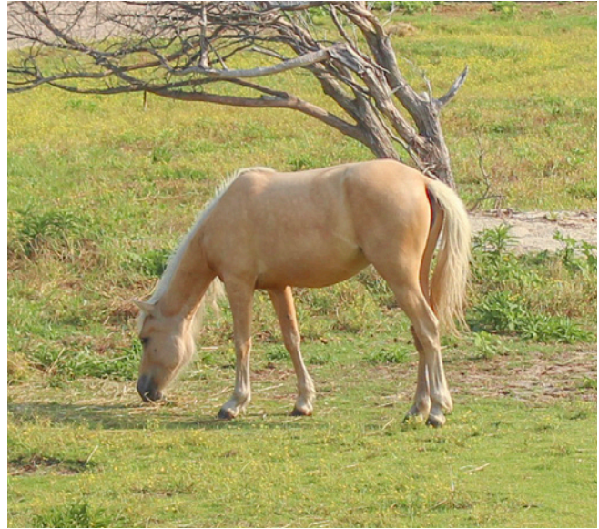
Jobelle, member of the Ocracoke pony herd.